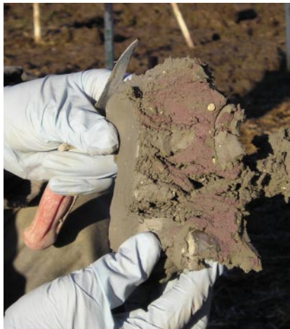
Soil core showing dye tracer

ARS' work attracted widespread interest from both the Danish government, academia and media personnel along with regional interest from other Scandinavian countries. Based upon the success at the sites, ARS is looking forward to future fracturing projects in Norther Europe.