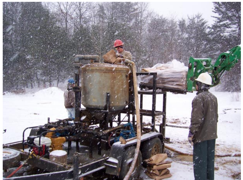
ARS crew working in snow

Groundwater monitoring within the treatment zone conducted by the site consultant showed immediate and long-term reduction in the target CVOCs. A paper titled "Enhanced Insitu Reduction of CVOCs using Zero-Valent Iron" is scheduled for presentation at the Battelle Chlorinated Solvents Conference in Monterey in May.