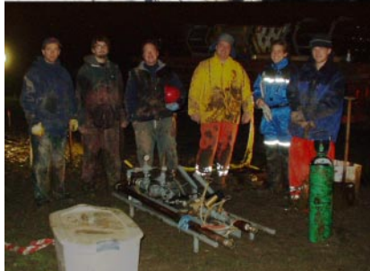
American and Danish team