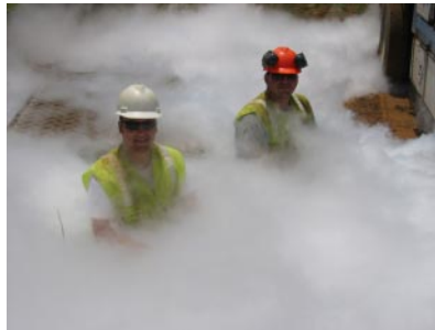
Field crew cooling off in water vapor condensate from liquid nitrogen pumping truck