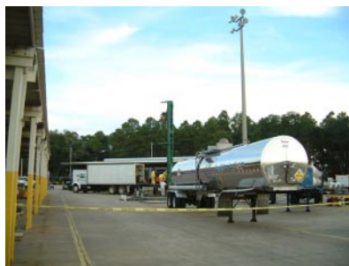
Injection operation showing tanker with 'site ready' 8% NaMnO 4