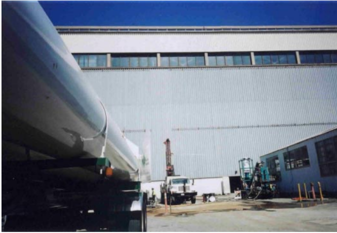
Nitrogen tube trailer, drill rig and injection trailer

As mentioned in our last newsletter ( http://www.ifracture.net/vol5iss3/index.html ), ARS conducted an expanded treatment in a TCE-contaminated area within Hunters Point Shipyard in 2004 after a successful technology demonstration in 2001. Recently a technical report was produced for the Navy reporting results of our work at Hunters Point Shipyard. The title of the report: